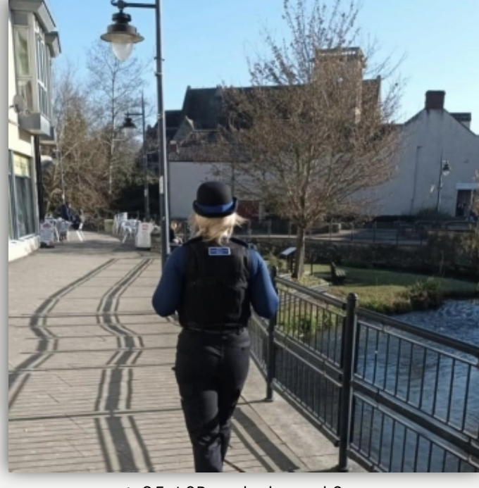
+ 15 School Talks / Visits